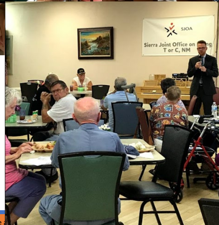
Elder Fraud Event Sierra Joint Office on Aging T or C, NM