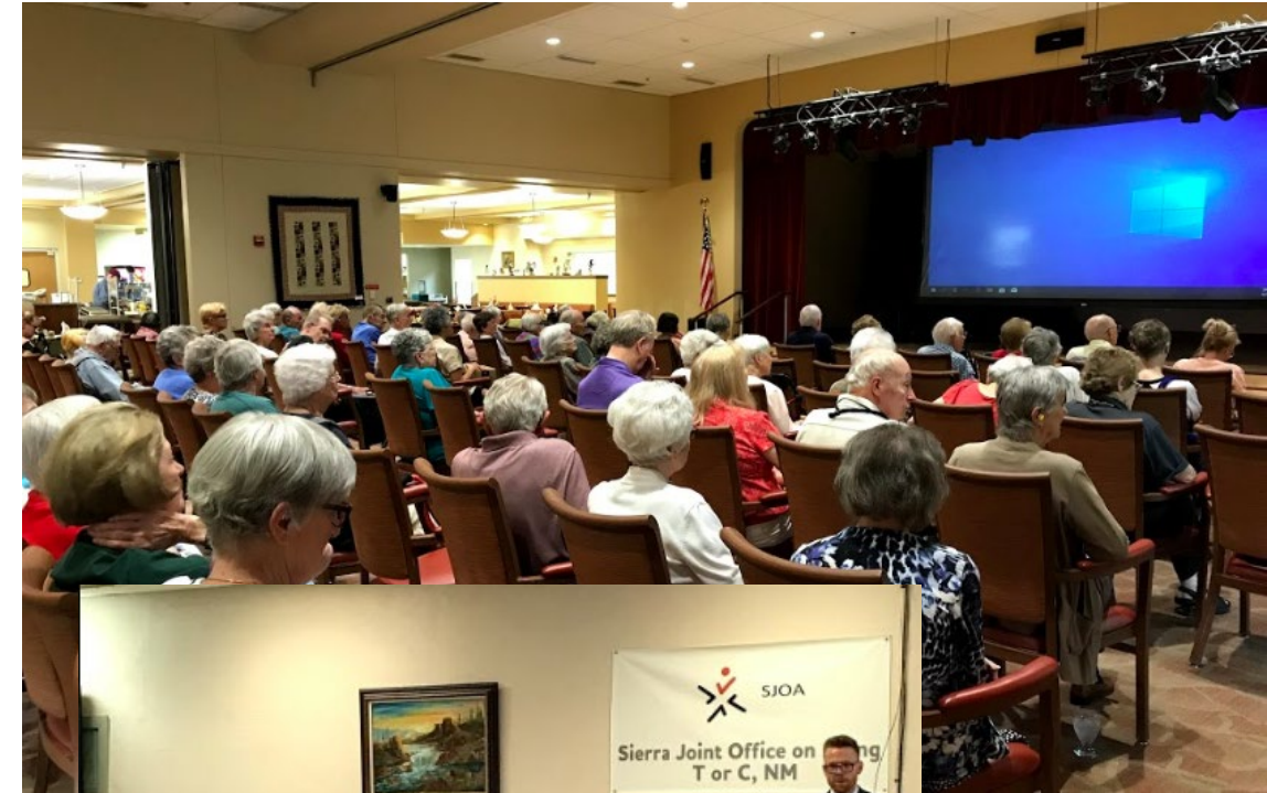
Elder Fraud Event, La Vida Llena , Albuquerque